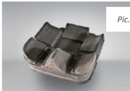
Pic. 1: Pre-assembled Kit