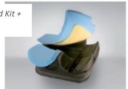
Pic. 3: Pre-assembled Kit + padding Kit