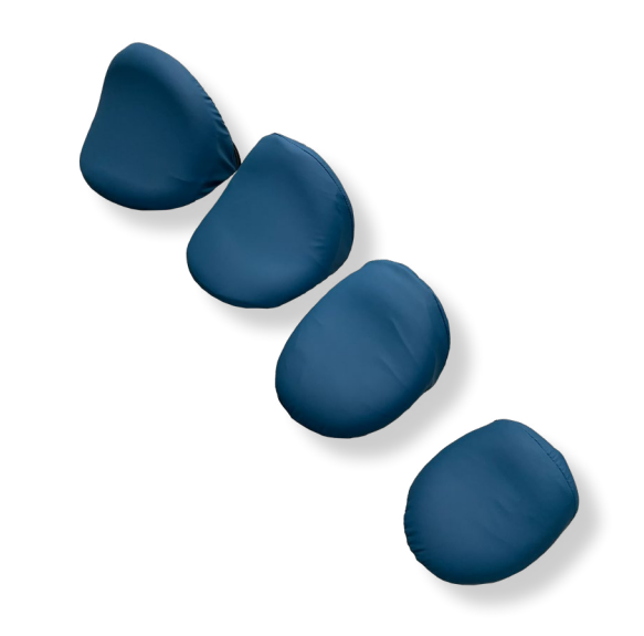
Imples Spinal support and filling system

Internal components extractable for adaptation